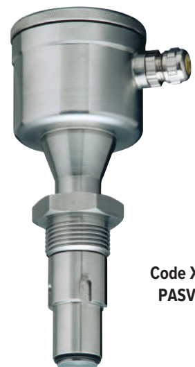
Code X12 PASVE