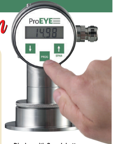
Display with 3 push buttons (Standard)