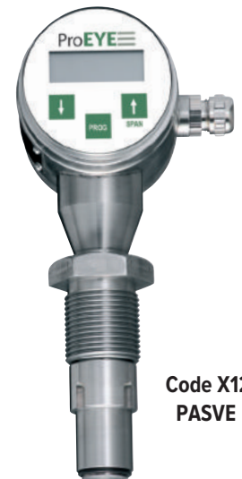
Code X12 PASVE