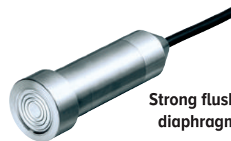
Strong flush diaphragm

Multipli manufactures a range of submersible level transmitters with cable or SS extension.